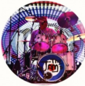
The Jam'd - The Jam Tribute Band