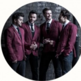
The West End Jerseys