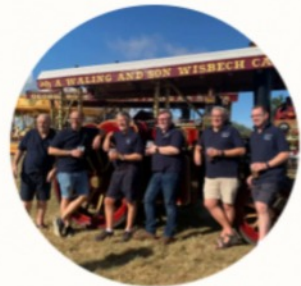
Isle 'Ave A Shanty