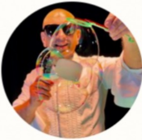
The Ultimate Bubble Show